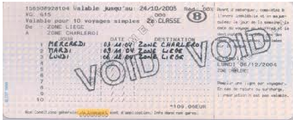
Figure 5 Keycard.

The keycard is a card with tickets for 10 individual (short) rides on it. A Keycard costs 20 euro and is available at the ticket office in the train stations. Rules for use you can find on : http://www.belgianrail.be/en/travel-tickets/passes-cards/key-card.aspx . With this card you can travel from Antwerp Central train station, Mechelen, or Mechelen Nekkerspoel to the train station of Sint Katelijne Waver. Be sure to correctly fill in a line every time just before getting on the train.