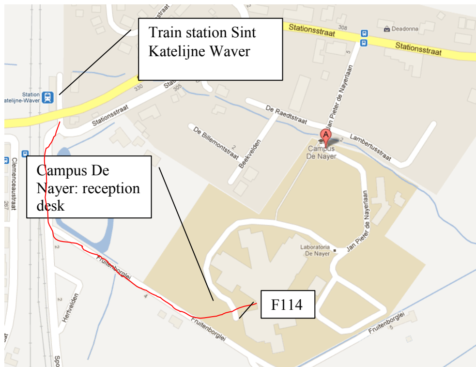
Figure 4 Sint Katelijne Waver arrival KU Leuven - campus De Nayer

Train from campus to Antwerp: (xx:00 and xx:30).